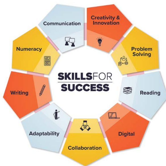
Figure 1 Skills for Success

This evidence brief was drafted to inform the design and development of skills training curriculum and approaches as part of the WOMEN FIRST project, funded through Employment